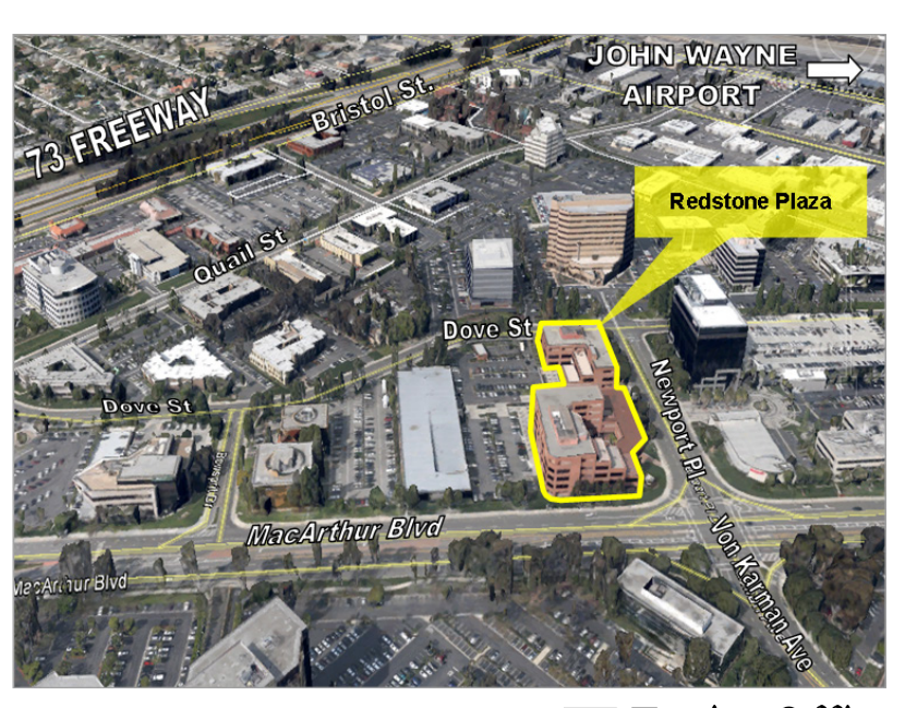
Professionally owned & managed by: